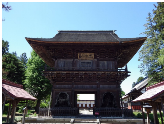
Sanmon (gate of 3 liberations) at Chosho-ji Temple - built in 1629

When we reached Hirosaki Apple Park, the Apple Blossom Festival was in full swing but we only stopped long enough for cold water and a snack before continuing on the trail. Toward the end was Choshoji, the largest of 33 Buddhist temples on Zenringai (Zen Forest St.). It was the temple of the Tsugaru family who ruled the western half of modern Aomori Prefecture in Edo times. When we finally returned to Otemon Square, we got sandwiches from a nearby bakery and joined others picnicking. The final total of walkers was 1,847 (1,272 on Saturday and 575 on Sunday).