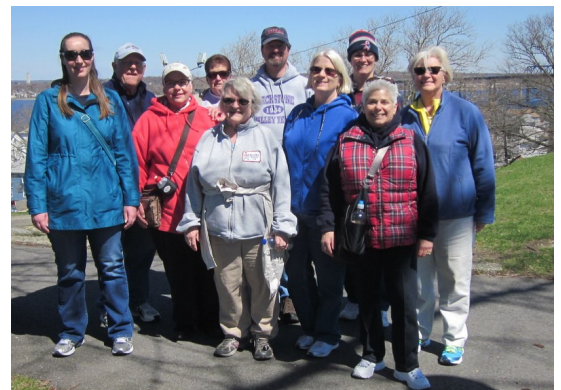
Plymouth group walk participants (left) and Fall River traffic detour survivors/walkers (right)