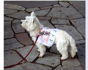
One volksmarching Scottie

Leaving the park, the trail followed sidewalks requiring frequent stops to wait for traffic signals to change. After a couple of kilometers, the flag bearers left us on our own to follow printed arrow signs and chalk arrows on the ground. Where turns might be confusing, an actual person holding an arrow pointed the way. Such was the case when we reached Ohashi Bridge where instead of crossing we were directed to a walkway under the bridge and along the Hirose River. The hillsides between the river and Aoba Castle site were turning lovely colors and we could see Lord Date Masamune's statue against the skyline. We also saw some snowy egrets along the water's edge. Soon we were back on sidewalks near the city center with some 20km walkers finishing the trail and collecting our stamps and certificates at the end. We spent the afternoon doing touristy things.