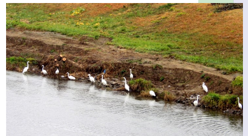
Egrets in the rain

enjoying the rainy day more than we did. Other than passing the local pro baseball team's stadium (Rakuten Eagles), can't say