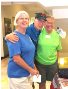
New Bedford