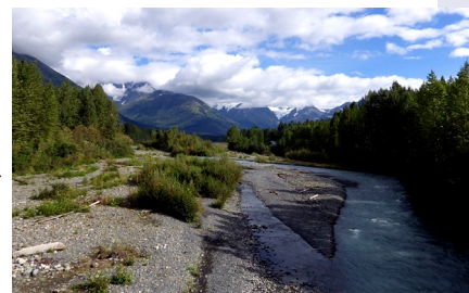
Glacier Creek with Eagle Glacier

two-lane road might have been dull except there were lovely views and people to chat with. We crossed Glacier Creek then we turned left across the highway to walk by the Public Library via Egloff Road (torn up for construction) and were glad to go through Girdwood Park.