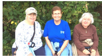
Milford Workers' Walk