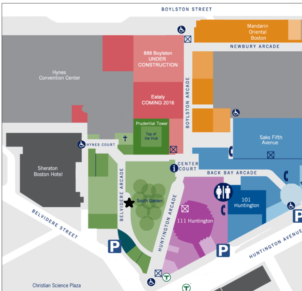
Prudential Center Map

Next Footnotes is combined January/February issue