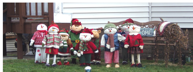
Above: A decorative bunch of holiday carolers camped out in a local front yard