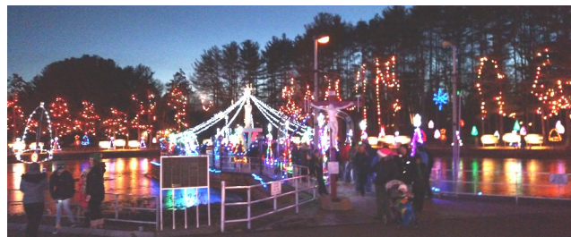
Above: The lights at La Salette