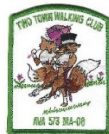
Right: TTWC Logo Patch