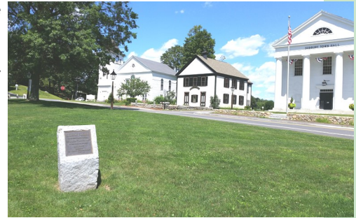
Town Common's Revolutionary marker with Grange Hall and Town Hall in background

The 10km route continues on through the Gray Reservation, managed by the Sudbury Valley Trustees. It follows the Glacial Features natural trail which takes walkers through white pine and mixed woods, past drumlins, streams, and manmade ponds. Look for glacial eskers and large boulders that were deposited when the ice sheets retreated.