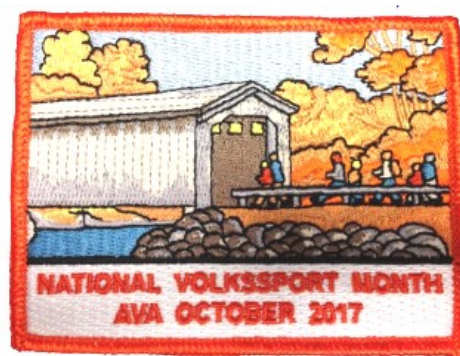
Left: Upper Charles Rail Trail

Enjoy a fall walk and celebrate National Volkssport Month with 5km and 10km routes in Milford on October 14. Hope to see you on the trail!