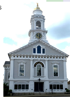
Milford Town Hall

The 10km route explores a bit of downtown Milford before joining up with the Upper Charles Trail. Walkers will pass by the Milford Town Hall, built in 1858 in an Italianate architectural style. It is listed on the National Register of Historic Places and is unusual among Milford's municipal buildings in that it is not built from the local granite. The route continues by a statue of General William Draper sculpted by Daniel Chester French. Draper was a Civil War general, Ambassador to Italy, and Member of Congress before retiring to head the Draper Corporation in nearby Hopedale, manufacturing cotton machines. Walkers will then pass through residential areas before returning to Main Street and the Upper Charles Trail.