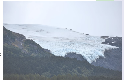
Above: Deadman's Glacier Below: Spencer Glacier in detail