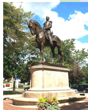
General Draper statue

The 5km route is completely on the mostly flat, paved Upper Charles Trail. The 10km route has one slight incline, but is otherwise mostly flat on paved surfaces. Both routes have an AVA rating of 1A, suitable for strollers and wheelchairs.