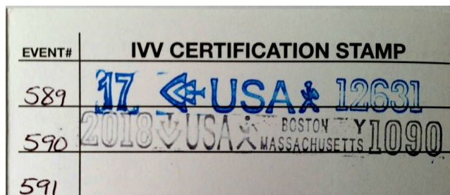
Example of old style imprint (top, 17) and new stamp style imprint (bottom, 2018). New stamps now include location detail and tighter spacing.