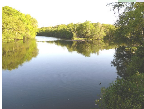
Blackstone River

Visit the Blackstone River Valley and the town of Blackstone with Walk 'n Mass on June 16. Whether you choose the 5km or 10km route, there's plenty to enjoy. Hope to see you on the trail.