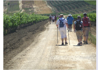
Part of the Selinunte Trail

How did we compare with our European co-walkers? A bit slower, a bit less cheerful or at least self-assured. Still, we completed our six kilometers. If we had had a flag there, we would have hoisted it.