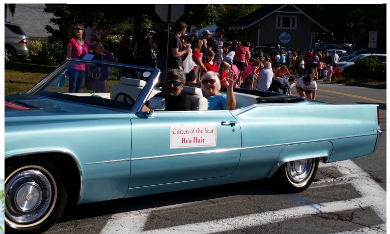
Above: Riding in style during the parade in a powder blue 1969 Cadillac. Perfect for waving and tossing candy to the waiting crowds.