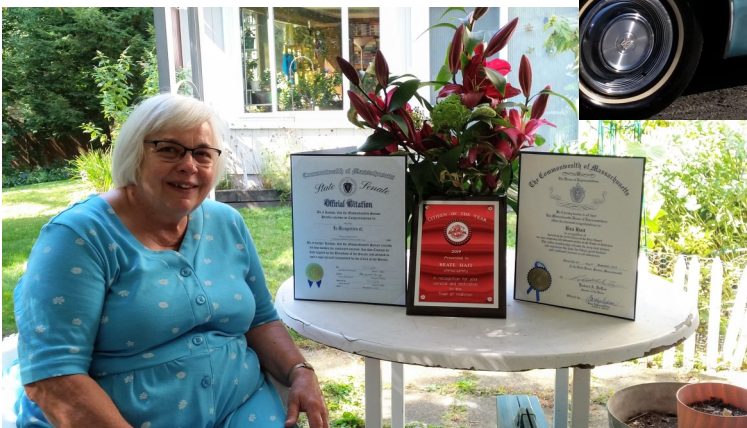
Left: At home with her award plaque and several commendations honoring her as a 2019 COTY.