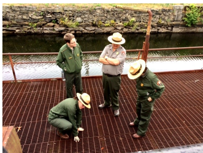
Lower left: The excitement was palpable as a dropped set of sunglasses allowed the Rangers to explore a typically cordoned off area and get an up-close look at the channels below the sidewalk that ran between the mills and the canal.