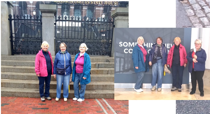
Boston Back Bay on January 1, 2022