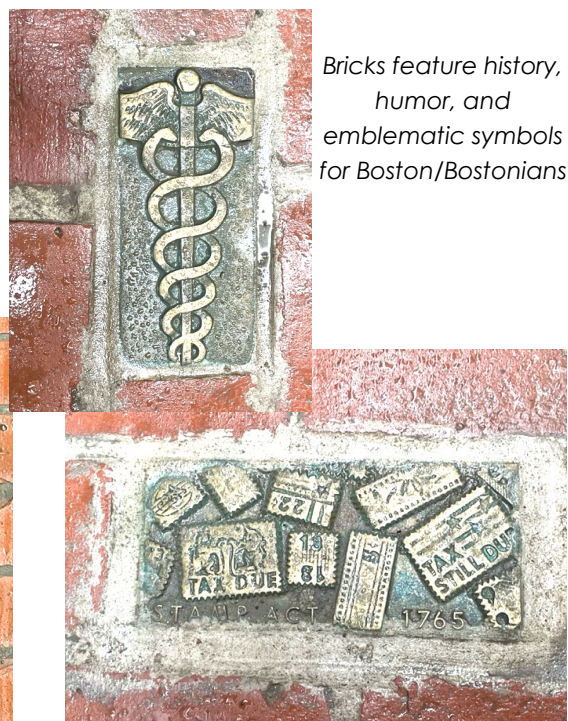
Bricks feature history, humor, and emblematic symbols for Boston/Bostonians