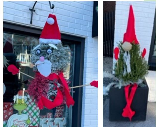
Whimsical Christmas decorations outside the floral shop

Do you have a volksmarching travel story to share?