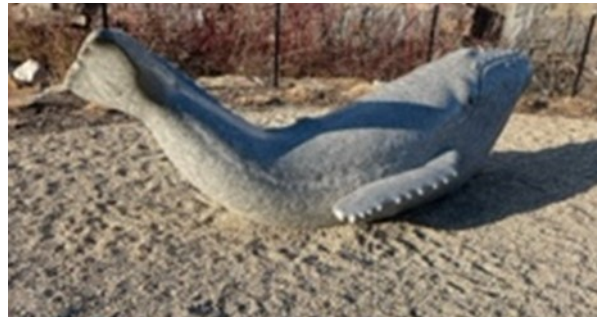
Millie, the 10-foot whale in Millbrook Meadow Park

When I go back this spring, once the walk reopens, I hope several people will join me on the hour plus train ride from North Station, enjoying the water views on the way up, and after an exhilarating walk, perhaps a coffee at Brother's Brew coffee shop or a lunch at the Hula Moon café!