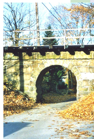
Arch Street's tiny one-arch bridge

Join Walk 'n Mass on Saturday, April 1 for 5km and 10km walks in Holliston. Come celebrate the beginning of spring (hopefully) and the return of our Soup Walk. There's no need to bring anything but yourself and your favorite soup bowl, but food contributions are welcome. You don't even need to walk. Stop by for some social time and catching up with your fellow walkers. Hope to see you there!