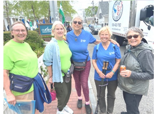
Walking in Provincetown