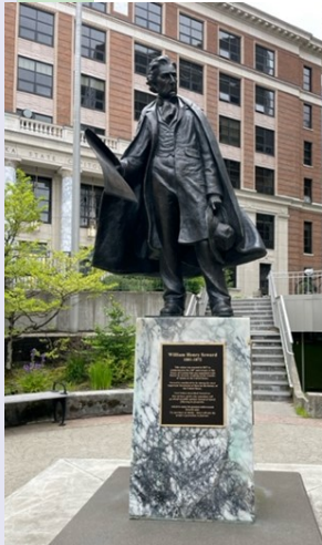
Statue of William Seward