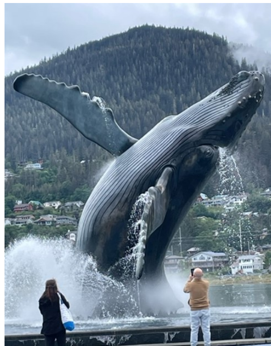
Humpback whale statue spraying water in Juneau Park